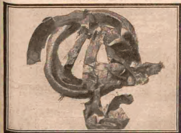
All that remained of the hat of the woman who was killed.