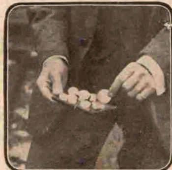
Hailstones as big as half-crowns.