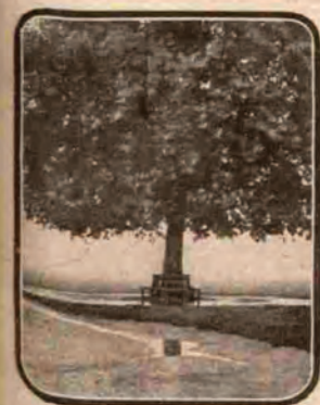
Three children killed here.