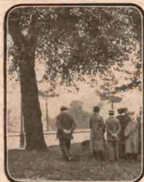
Two adults and child killed here.