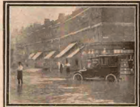
Mitcham-road, Tooting, which looked like a river.

Six persons were killed and five injured during the terrific thunderstorm, which broke over London yesterday. It was on Wandsworth Common where the fatalities occurred. Under a tree were gathered five children, who thought the storm was great fun. They were all singing, when suddenly a flash huddled them together in a heap. Death had